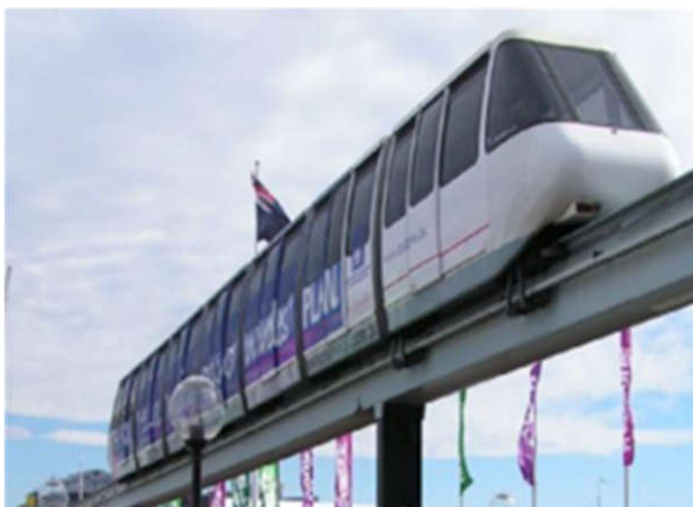
Figure 3. Monorail on its track