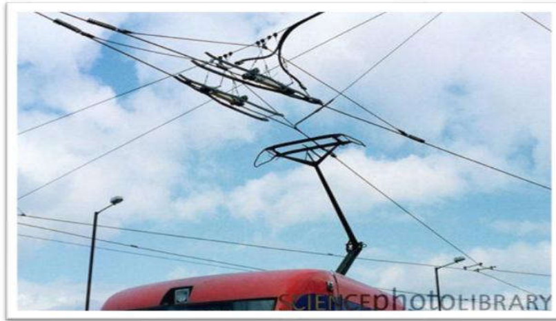
Figure 1. Overview of inner-city tramway using a pantograph [12]

frequently used in 1980s and 1990s [11].