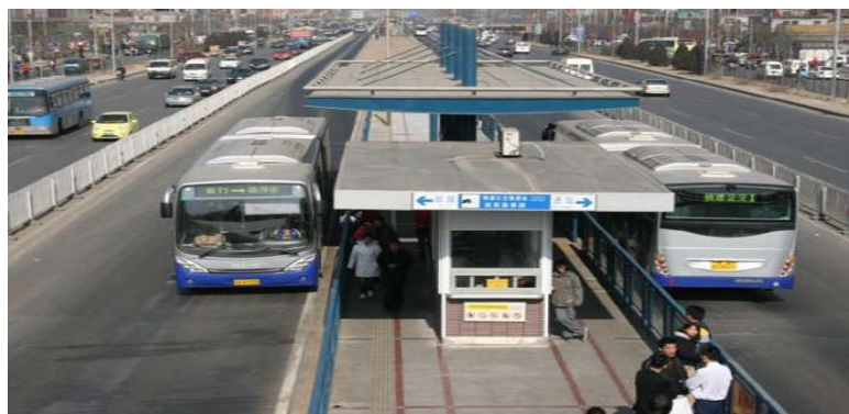
Figure 2. Bus rapid transit