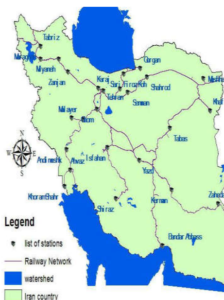
Fig. 3. The passenger depots in Iranian railway network

By regarding the conditions required to constitute trip sequences, 19025 feasible pairings were obtained for the trips of the network. To find the optimal solution of the railway crew scheduling problem, both set covering and Transition Reduction models were used.