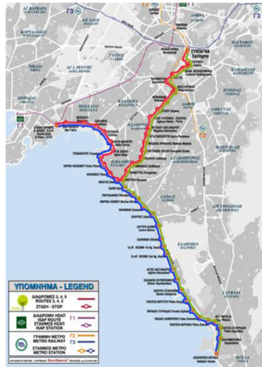
Figure 1. Athens' tramway system [8]

This section describes the steps that were followed for the data collection, the examination procedure of normality and collinearity of the variables, the specification of the models and the assumptions taken. In addition, it gives the parameters estimates of the regression models and their interpretation.